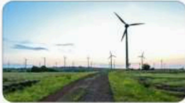
Chalakeswadi Asia's Largest Windmill Project