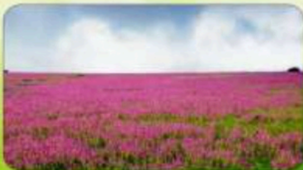
Valley of Flowers - Kas Plateau